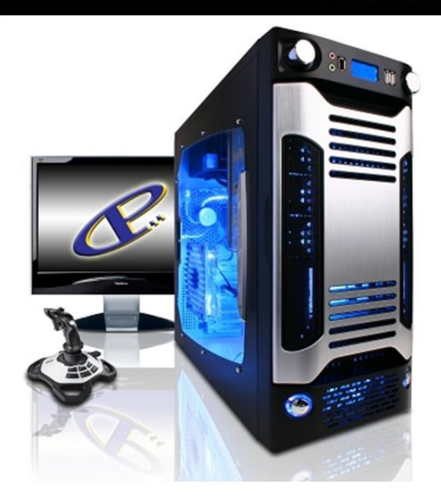
$30-$50 per hour for technical service $30-$100 per hour for all Consultation $60-$100 for most PC service jobs $200-$500+ for Web-design packages

Professional Technology & Business Solutions