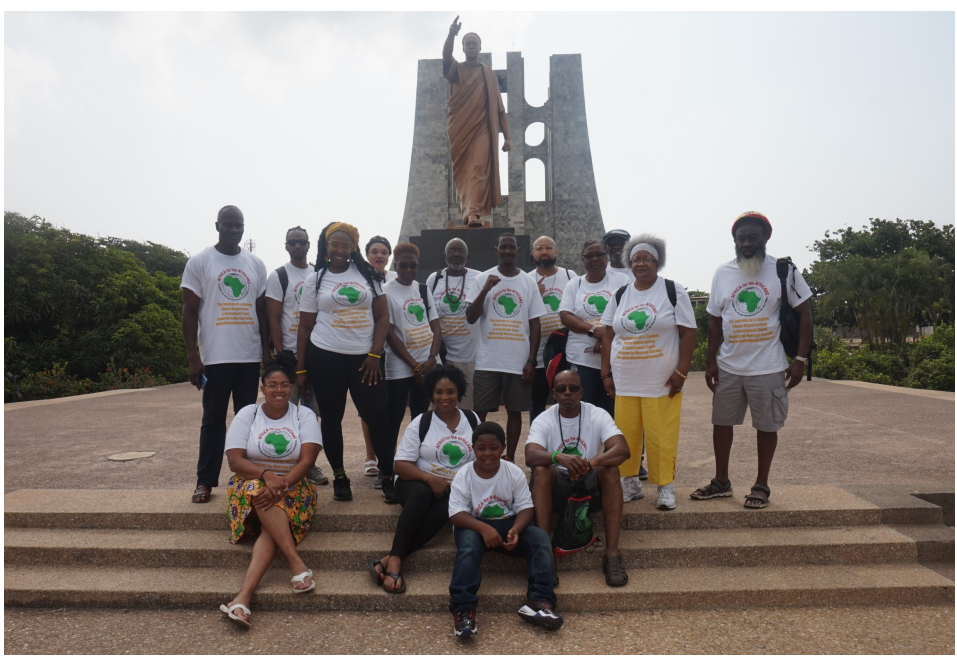
Ghana Repatriation and Investment Tour Dec 2020